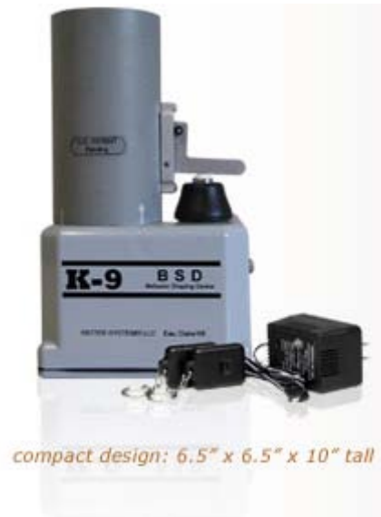
compact design: 6.5" x 6.5" x 10" tall

Device is intended to be used with adapter plate for initial odor presentation directly above and around reward item. A plastic rivet and cap is furnished for horizontal use.